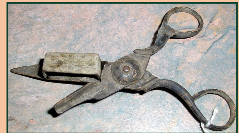
Reconstructed candle snuffer from pieces located near the site.

Reference : Jeanette and Rudi Paoletti "McEvoy's Track- Gateway to the Gippsland Goldfields 2013"