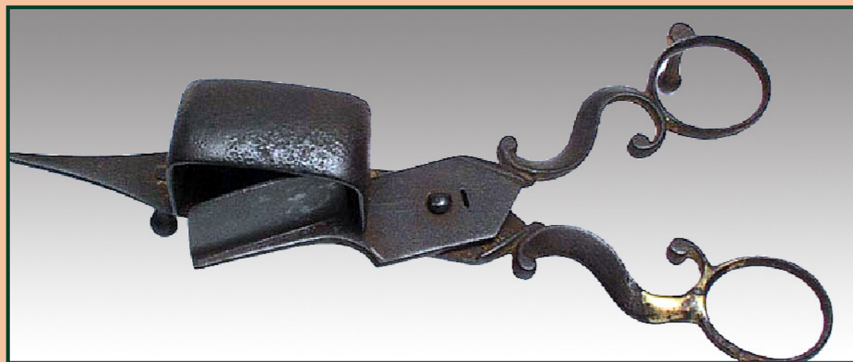
Candle snuffer as it may have looked like.

A curious scissor like tool was found near this site and appears to be a candle snuffer made in around 1864. Such tools are still made in the United Kingdom today.